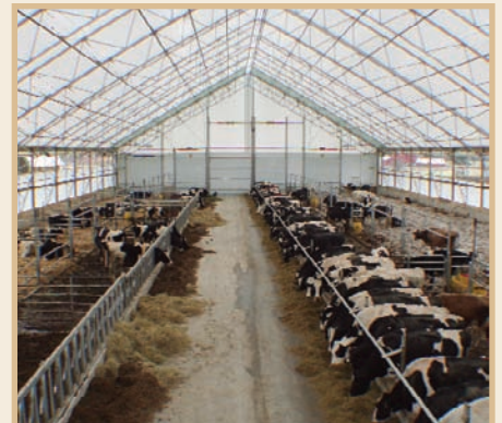
100' w x 260' l (30.4m x 79.2m)