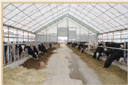
100' w x 260' l (30.4m x 79.2m)