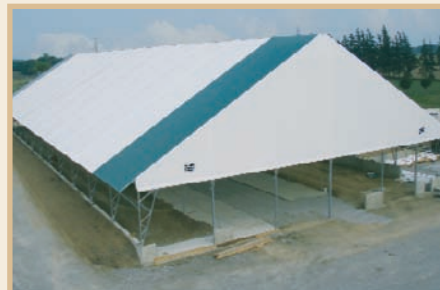
100' w x 260' l (30.4m x 79.2m)

North America: 1.800.268.3768 • UK: 0800 3891490 • outside NA & UK: +44 (0)1270 620 475 • web: www.coverall.net