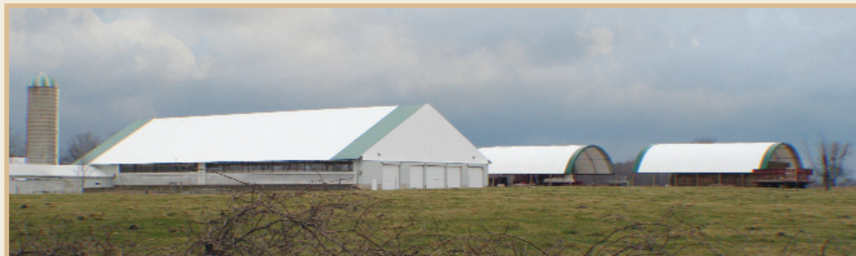
100' w x 260' l (30.4m x 79.2m)