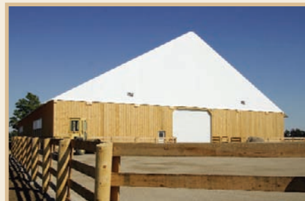
110' w x 180' l (33.5m x 54.8m)