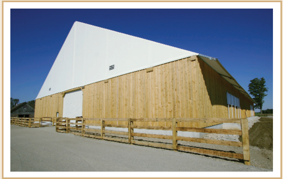
110' w x 180' l (33.5m x 54.8m)