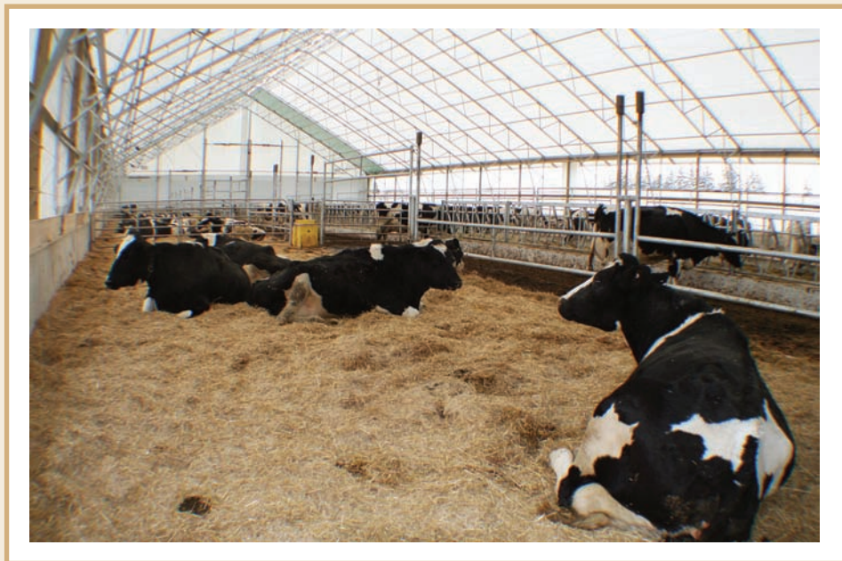
100' w x 260' l (30.4m x 79.2m)