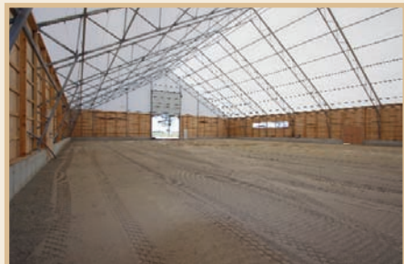
110' w x 180' l (33.5m x 54.8m)