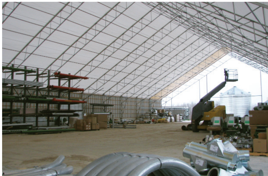
120' w x 240' l (36.5m x 73.1m)