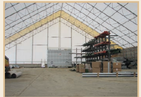
120' w x 240' l (36.5m x 73.1m)

Your local authorized Cover-All Dealer is part of a worldwide product support network that will provide you with service and support for all your building needs - before, during and after your building installation.