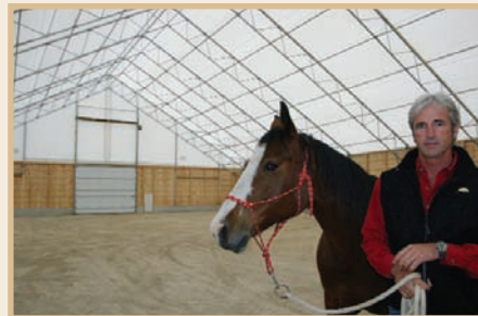
110' w x 180' l (33.5m x 54.8m)